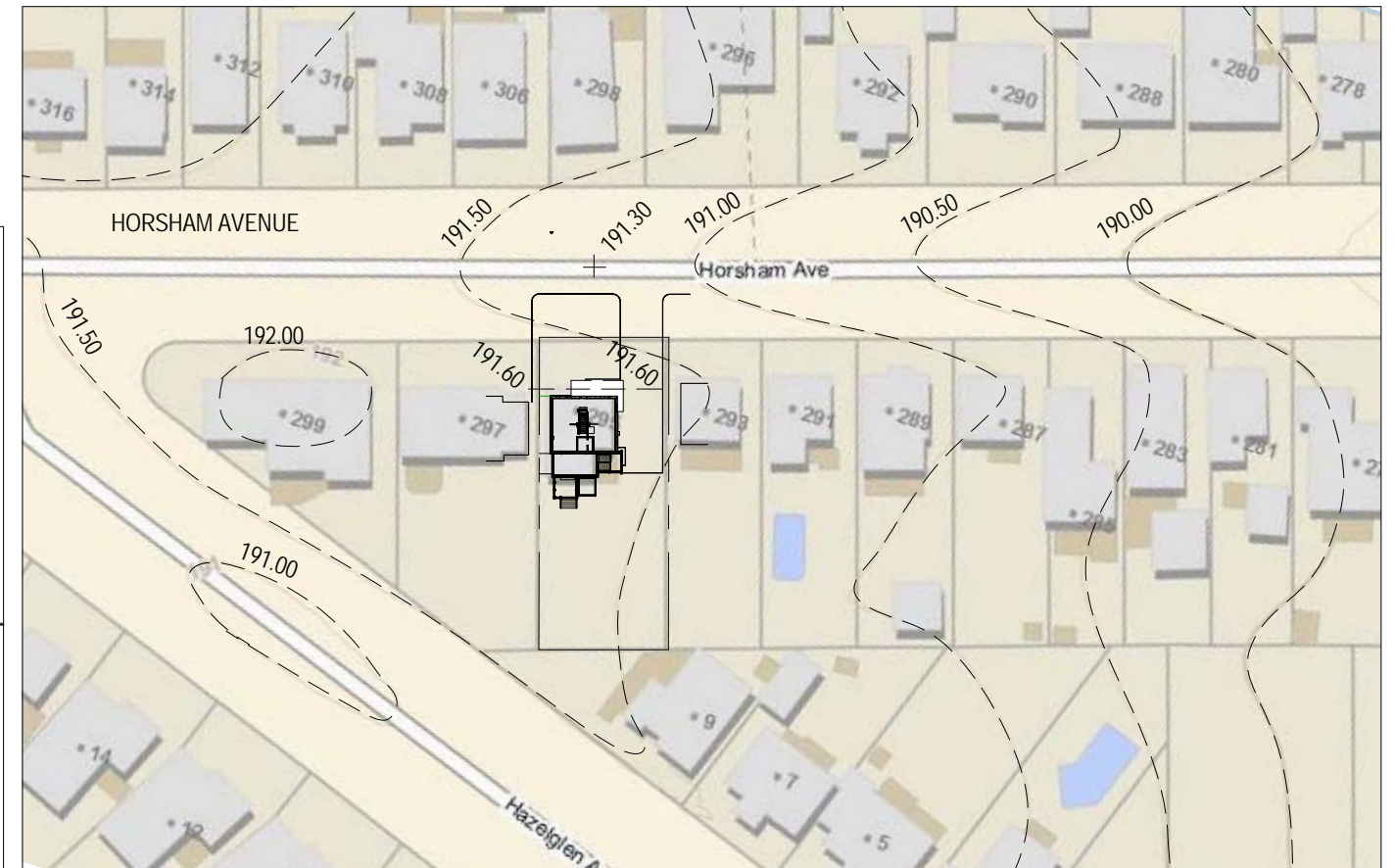
① Keymap Showing Contour Elevations 1" = 80'-0"

Established Grade per Bylaw 569-2013 Grade points taken at each side of property at front yard setback both equal 190.60 m. Geodetic Elevation of 190.60 m referenced on the drawings as 0.00